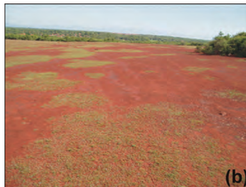
Figure 1: (a) Satellite image showing the Ussangoda serpentine deposit. The white broken line demarcates the boundary of the deposit. Numbers indicate the locations from which the samples of serpentine were collected. (b) Photograph showing the red soil overlaying the deposit.