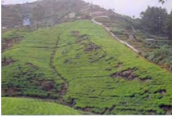
Figure 2: A landslide revegetated with tea (left) and terraced vegetable plots (right).