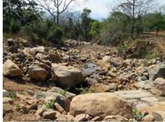
Figure 3: Debris-flow/landslide coming down the hills near Minipe and flowing towards the Victoria Reservoir (beyond the trees). There are 14 such flows cutting across the main road (top right corner) within a 10 km stretch. Note the size of the boulders.

Water is the least regulated, most profligately exploited and cheapest natural resource. With current per capita water availability of \sim 2492 \text{ m}^3 per capita per year, Sri Lanka does not face a severe water crisis at present. However, the likelihood of water scarcities in the future, especially at six district levels is a cause for concern. Population growth, rising living standards and per capita incomes, poverty alleviation and improved quality of life and changing life styles are all reflected in increased per capita water use. With a projected population of > 25 million by 2030 and the likelihood of climate changes, water availability for irrigation, agriculture and food production and domestic use could drop well below the recommended 50 litres/capita/day and with severe consequences for water security 22 .