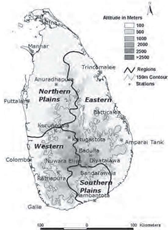
Figure 1: Topography, location of meteorological observatories, and regionalization for Sri Lanka. The 150 m contours that separate the low areas from the hilly areas are indicated.

Correlation analysis: The Pearson correlation coefficient was used to identify relationships between ENSO indices and rainfall 19 . A correlation was taken to be significant when the no-correlation null hypothesis was exceeded with a probability of 95%. Significance of correlation values were tested at 1% and 5% levels.